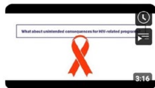
Prescription Drug Affordability Boards: A Threat to Ending the HIV...