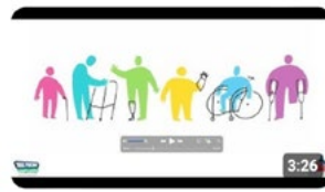
Prescription Drug Affordability Boards and the ADA: A Potential...